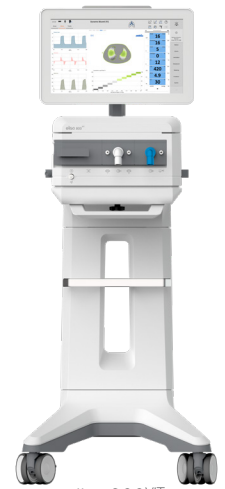
elisa 800 VIT