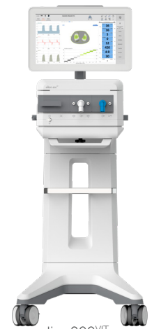
elisa 800 VIT